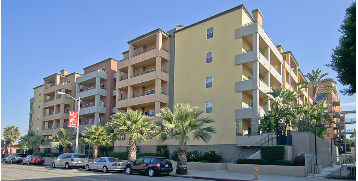
838 Pine Ave #116, Long Beach, CA 90813